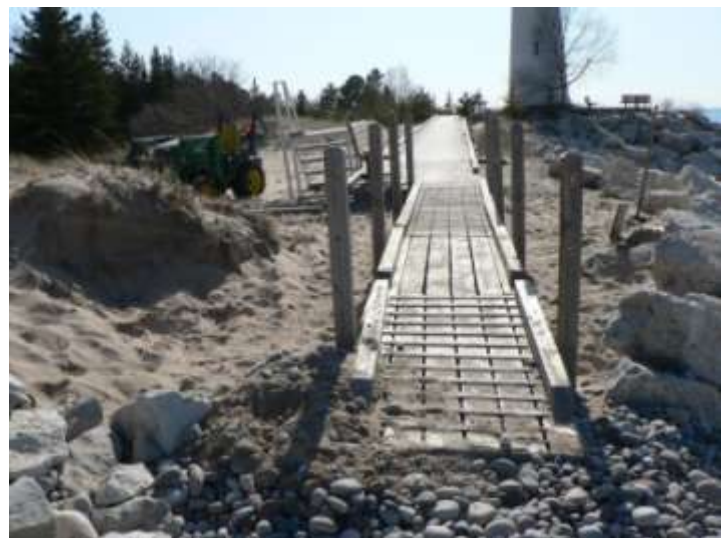
The new, improved ramp to the beach at the east end of the boardwalk.