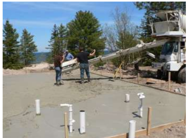
Pouring the concrete foundation.

As work progresses on this building, the costs are adding up faster than expected. We are in need of some financial assistance to finish this project. If you are able to spare a little, or a lot, please consider making a donation to the Crisp Point Lighthouse Fund. See page 6 for details.