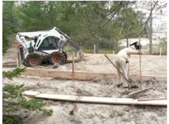
Preparing the forms for the foundation.

We are excited to announce that construction on the new building near the lighthouse has begun. This building is designed to look like the old fog signal building, and is about 22' x 40'. The inside will be one large room. On the back, two bathrooms will be accessed from the outside. The foundation is poured, the drain field is buried, and the block walls will be done soon.