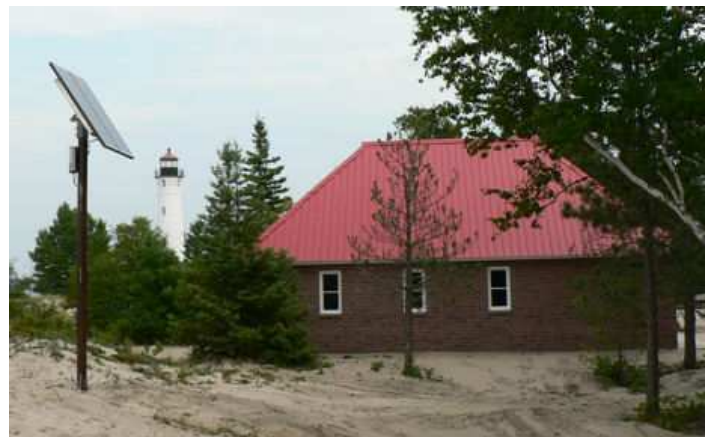
The new building, tower and solar panel.