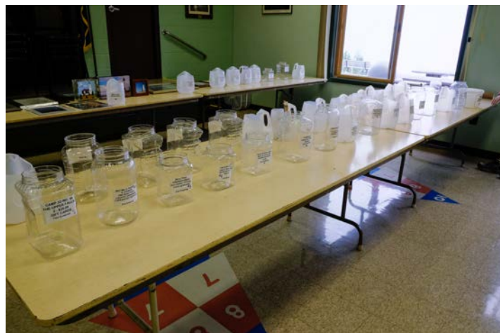
Jars used to collect raffle tickets