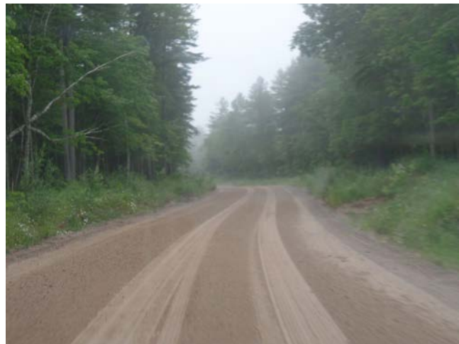
County Road 500 in great shape