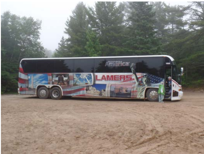
US Lighthouse Group from Washington State

took three tries and they were on their way again. The US Lighthouse Society out of Washington State organized the Bus Tour. There were just under 50 on the bus.