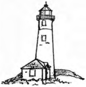
"I Like My Beacon Crisp"